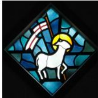
2 ACTS - persevere