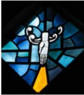
1 GENESIS - begin

Three phases — projects determines what happens in each phase