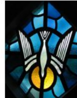
3 WISDOM - learn

ONGOING COMMUNICATION: Meetings Documentation Parish Media Archive